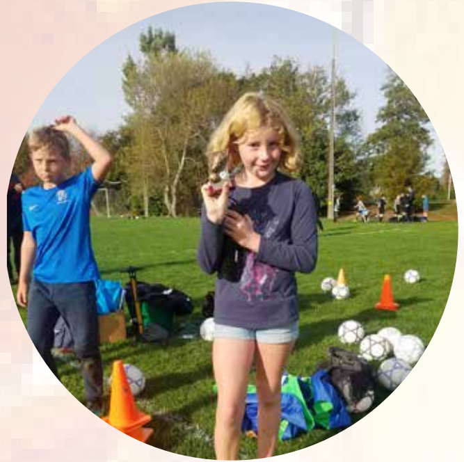
Grace Golden Bay Football Club Player of the Day Non Travelling Juniors 11/05/2019