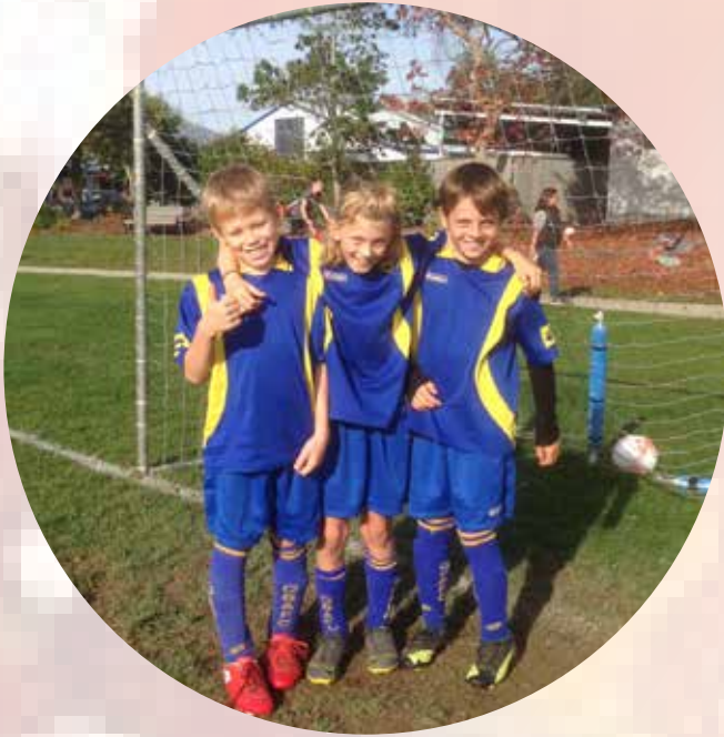
Nikau Golden Bay Football Club Player of the Day 9th Grade 04/05/2019