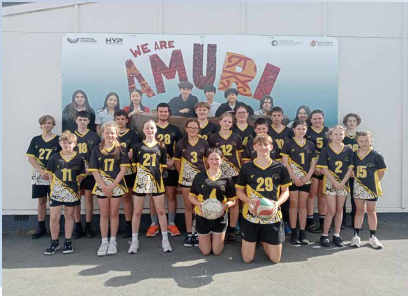
2024 Mini TOSI Team